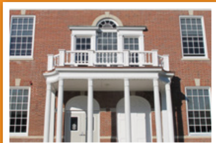
MEXICO HIGH SCHOOL EAST PORTICO AFTER