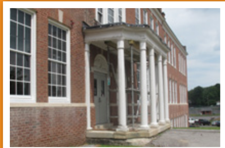
MEXICO HIGH SCHOOL EAST PORTICO BEFORE